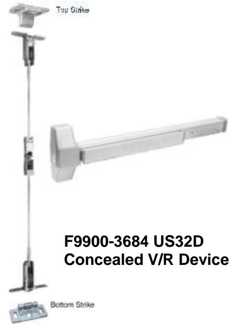
F9900-3684 US32D Concealed V/R Device

The Bottom Rod of F9900 can be omitted to use as Less Bottom Rod (LBR) with a UL listed Auxiliary Fire Latch (9279)