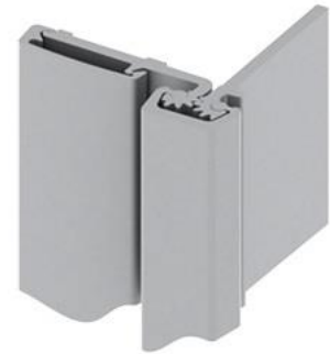
AGH-053HD Gear Hinge