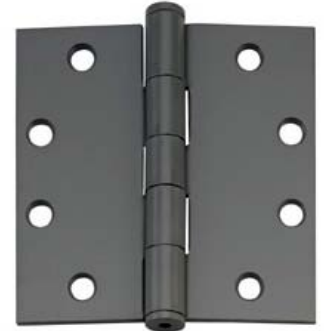
CH4002 4" x 4" x square US10B