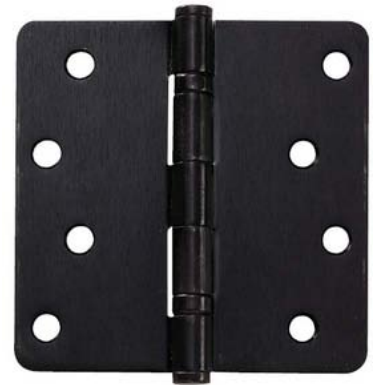
RH7210 4" x 4" x 1/4"R US10B